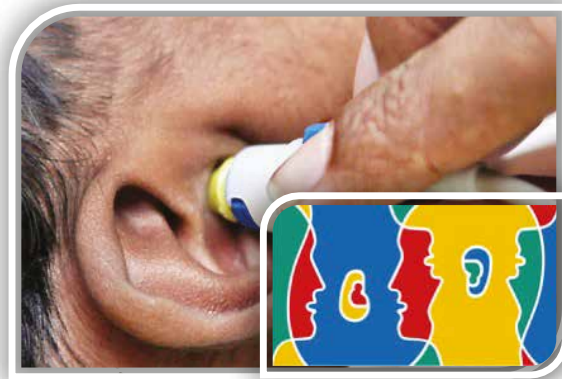
DEAF & BLIND SCHOOL IN RATMALANA