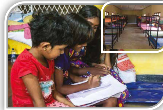
HOME FOR THE CHILDREN