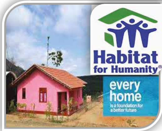
HABITAT FOR HUMANITY SRI LANKA