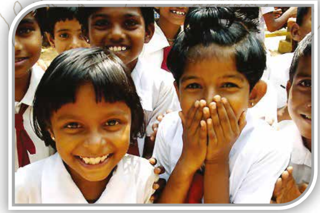
SCHOOL IN WELLAMPITIYA IN VICINITY